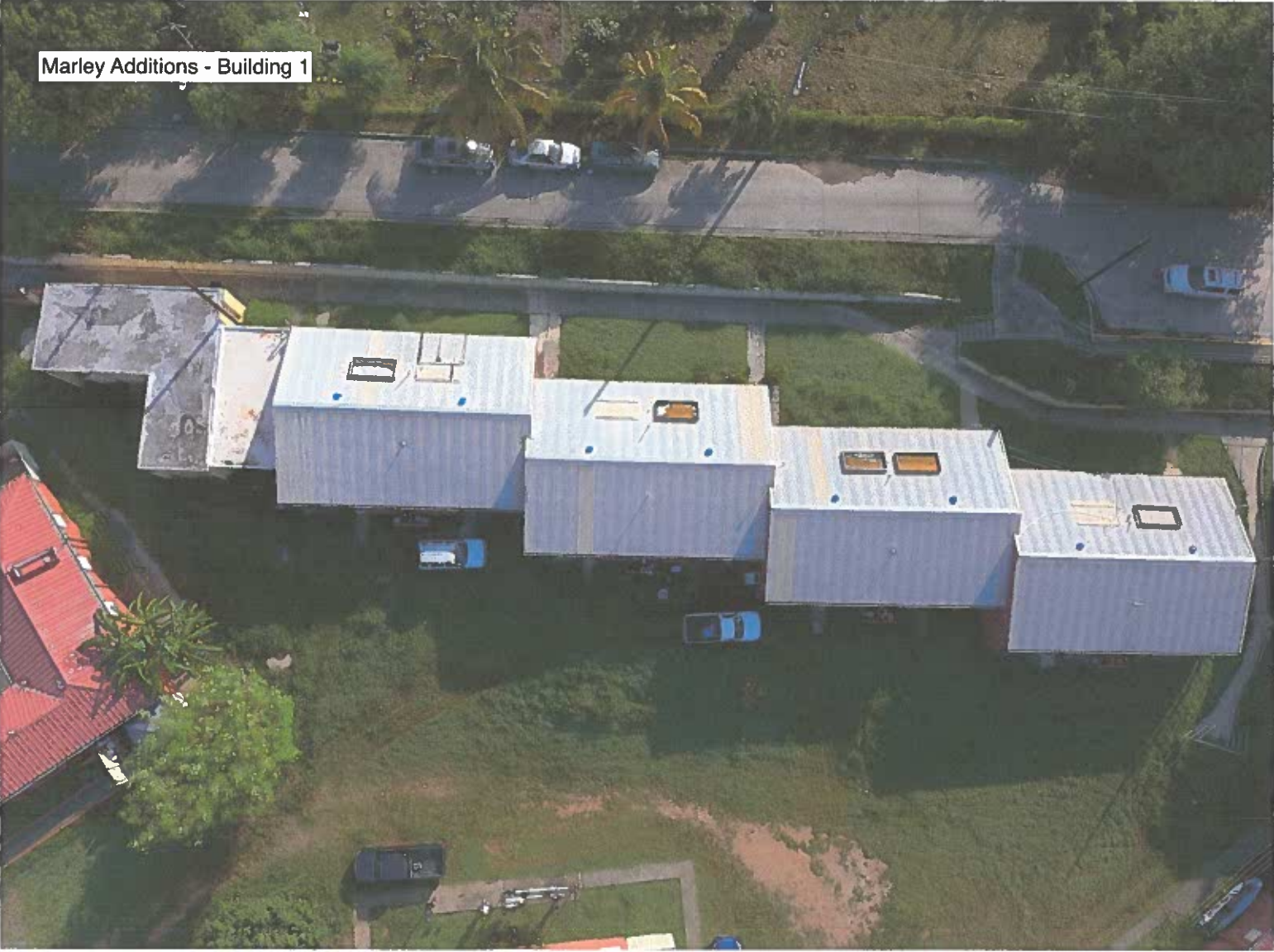
Marley Additions - Building 1